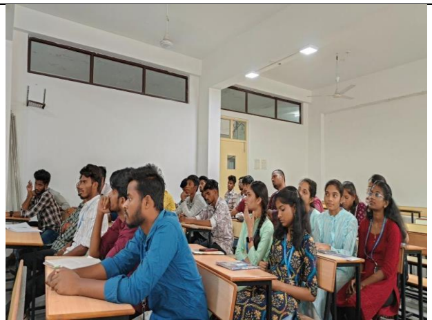
Students present in the session